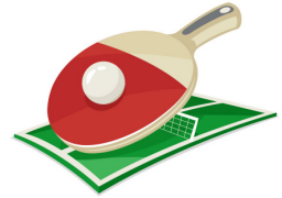
TABLE TENNIS – KS2